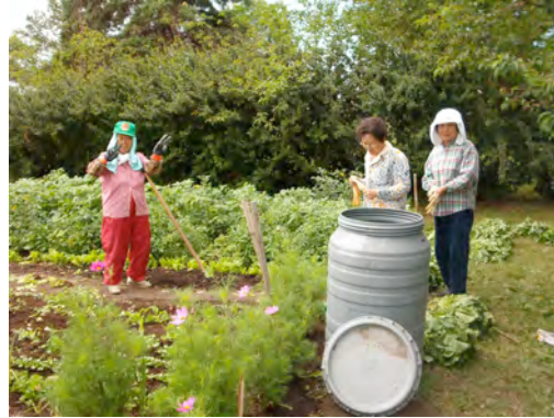
Vietnamese Seniors at Millwoods Wagner