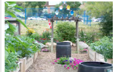
Our Urban Eden