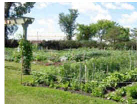
U of A Campus Garden

Finally, a layer of mulch—straw, grass clippings, shredded leaves, bark chips—helps keep the soil consistently moist. Organic matter, such as compost, mixed into the soil when you plant helps to hold moisture, too. With these handy tips to help you out you're now ready to go out and make the most of the water in your garden. Enjoy!