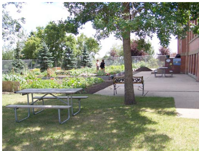
Alex Taylor Community Garden